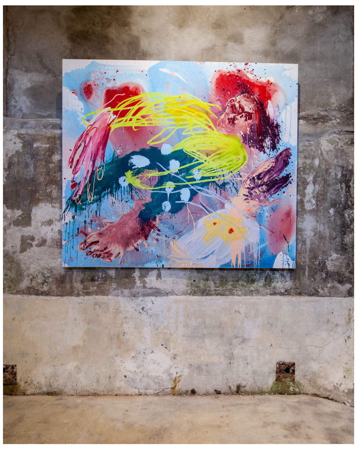
Installation view: Cristina de Miguel: El caer y el viento , Villa Magdalena, Donostia-San Sebastián.