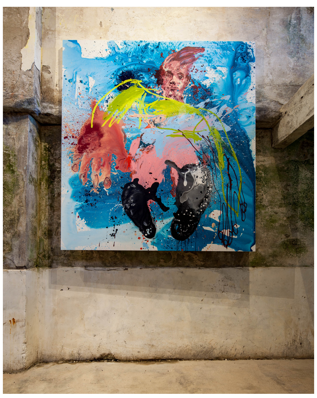
Installation view: Cristina de Miguel: El caer y el viento , Villa Magdalena, Donostia-San Sebastián.