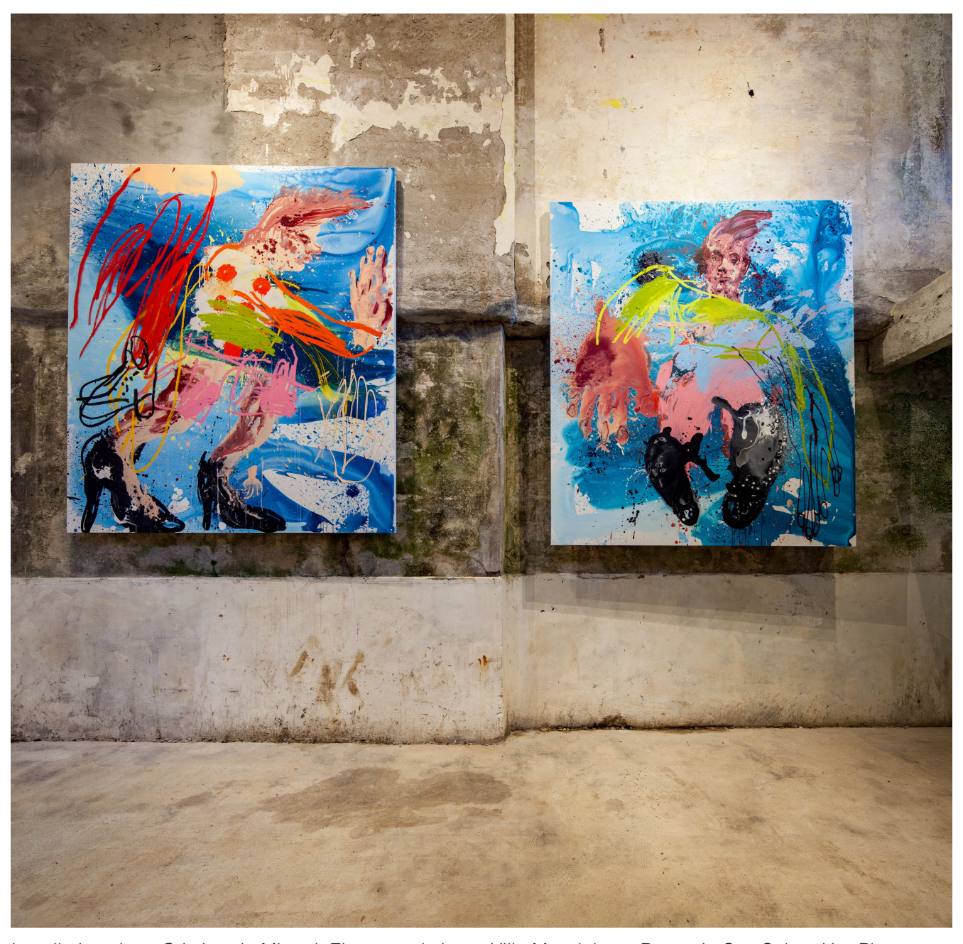
Installation view: Cristina de Miguel: El caer y el viento , Villa Magdalena, Donostia-San Sebastián. Photography by Idoia Unzurrunzaga